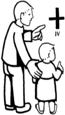
Praying the Stations of the cross

Another Lenten custom involves taking a journey... to the Holy Land! Going on pilgrimage has always been an important part of our Christian tradition. By visiting a place where a religious event occurred, a pilgrim hoped to share in the experience associated with that place. The desire to visit Jerusalem and the Holy Land was very important to Christians long ago, but because of the danger and expense of travel, and the political climate of Palestine, such a journey was not always feasible. When the Friars of the Franciscan Order took over the care of the Holy Places in Jerusalem in 1342, they began to erect "Stations" in Churches back home in Europe. It was a way to "go" to the Holy Land without ever leaving home. The custom of the Stations quickly spread to parish Churches, and the devotion of the Stations of the Cross was born.