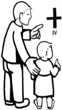
Praying the Stations of the cross

Another Lenten custom involves taking a journey... to the Holy Land! Going on pilgrimage has always been an important part of our Christian tradition. By visiting a place where a religious event occurred, a pilgrim hoped to share in the experience associated with that place. The desire to visit Jerusalem and the Holy Land was very important to Christians long ago, but because of the danger and expense of travel, and the political climate of Palestine, such a journey was not always feasible. When the Friars of the Franciscan Order took over the care of the Holy Places in Jerusalem in 1342, they began to erect "Stations" in Churches back home in Europe. It was a way to "go" to the Holy Land without ever leaving home. The custom of the Stations quickly spread to parish Churches, and the devotion of the Stations of the Cross was born.