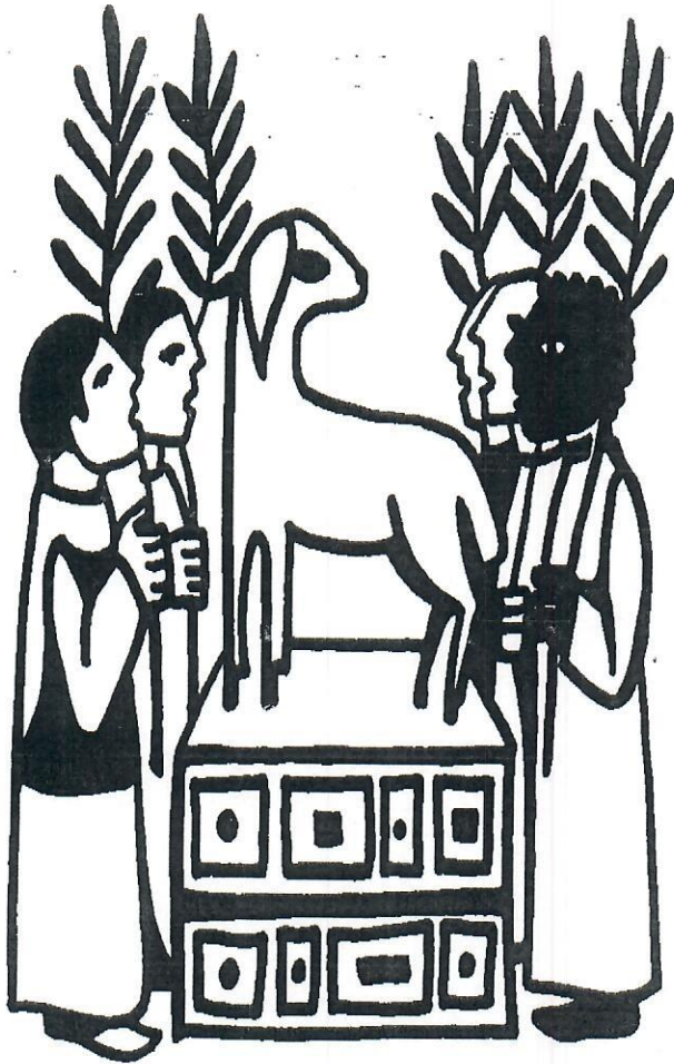
Feast of All Saints—

As the Church year comes to a close and nature itself begins slowly to fade from Fall glory to the browns of winter-time, the Church prepares to celebrate two great feasts: All Saints and All Souls . We remember on those days those people who have rested in peace with God and have entered heaven's Banquet. Saints, official and unofficial, pray for and with us as we continue our earthly journey.