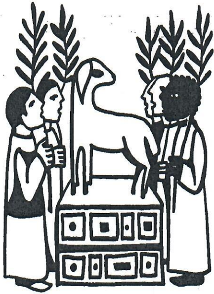
Feast of All Saints —