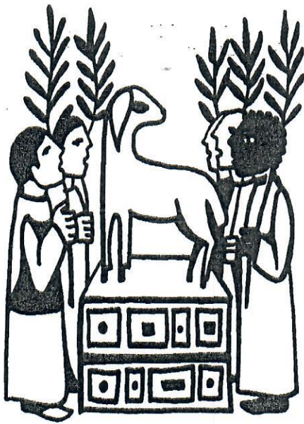
Feast of All Saints—