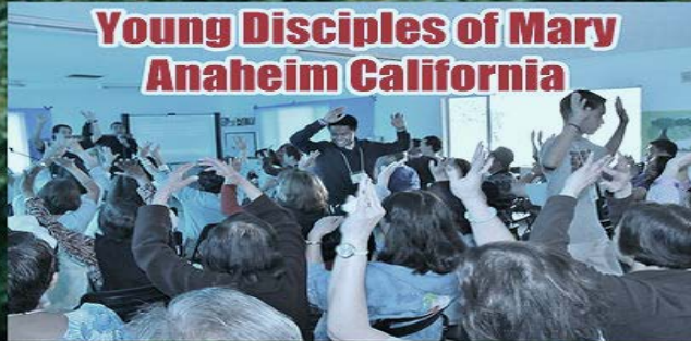
Young Disciples of Mary Anaheim California