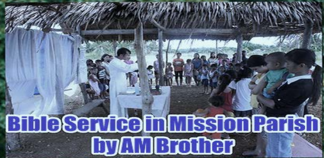
Bible Service in Mission Parish by AM Brother