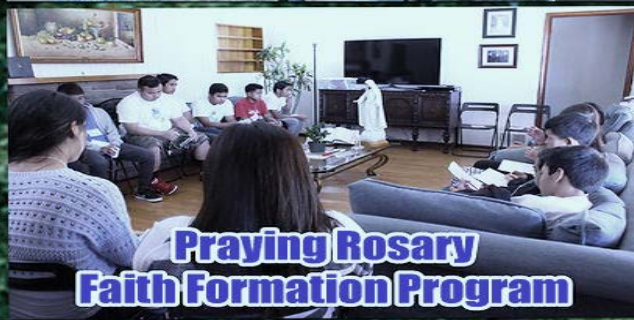
Praying Rosary Faith Formation Program