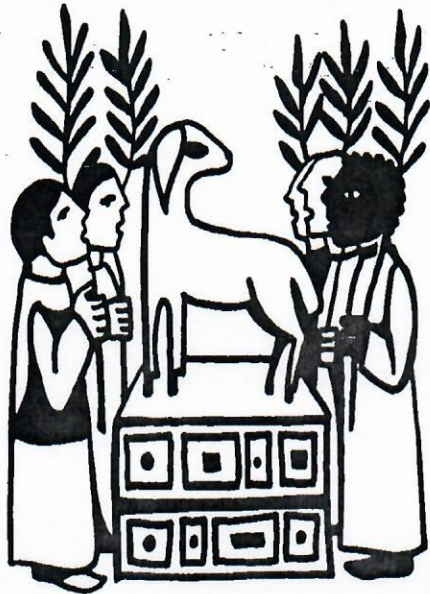
Feast of All Saints —